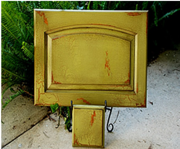
"Green Apple Crackle"

Follow the link below to download our current free recipe!